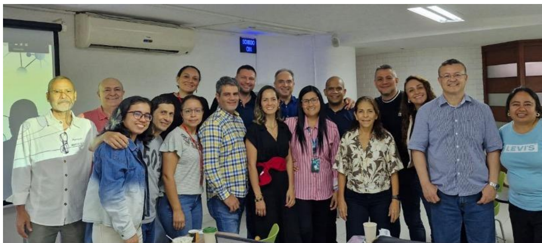
A picture of the class and some of the core staff.